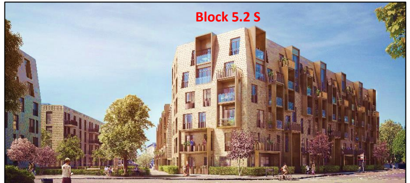
View from Kilburn Park Road – opposite St Augustine’s Church

The scheme is likely to take 3 years to complete and will be handed over in phases from 2020.